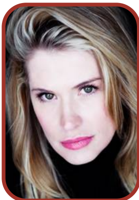
Event Chair Kristy Swanson TV and Film Star

Help us give hope for the future www.thanksusa.org